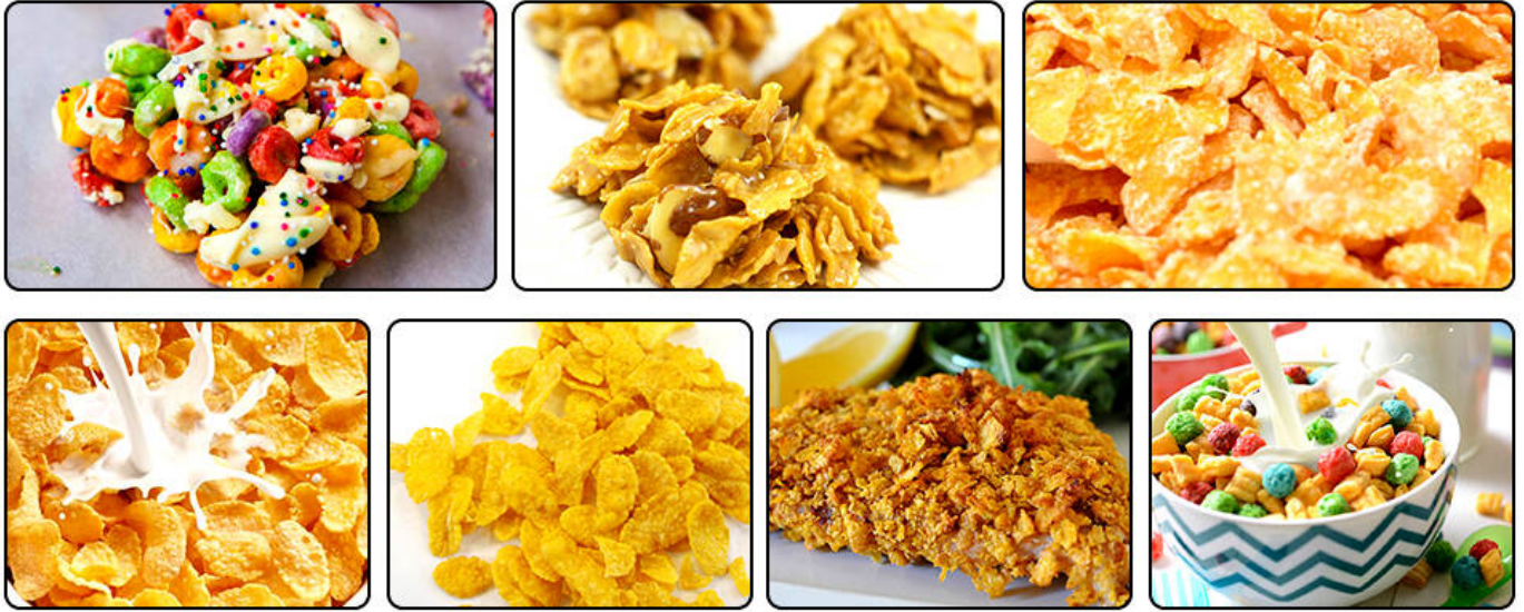
Sample of Corn Flakes of Corn Flakes Productiin Line