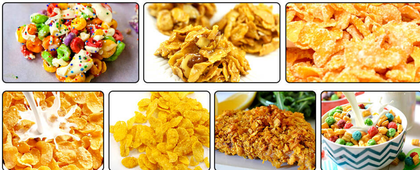
Sample of Corn Flakes of Corn Flakes Productiin Line