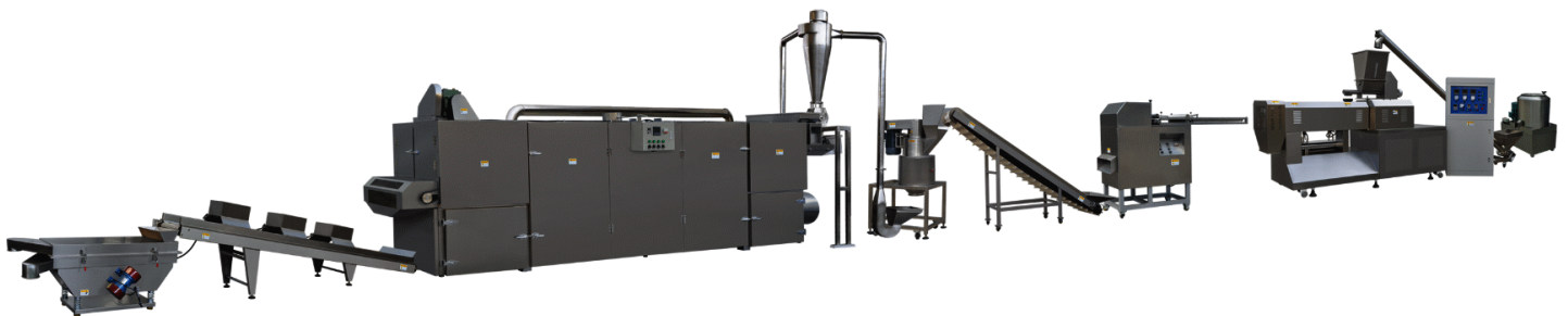
Flow Chart Of Bread Crubms Production Line

Flour Mixer-Screw Hoister -Twin Screw Extruder- Muti Functional Shaper- Hoister- Crumb Machine- Drying Oven