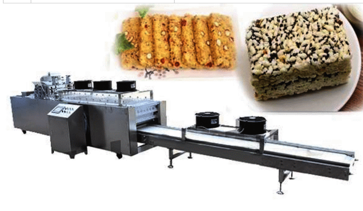
snack bar production line