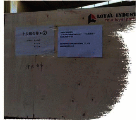
Packaging & Shipping