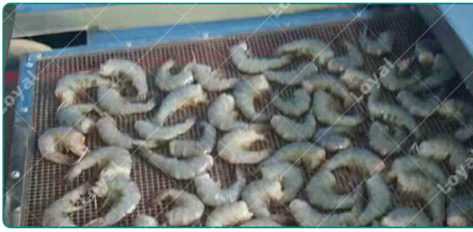
Applications Of Microwave Prawn Drying Machine: