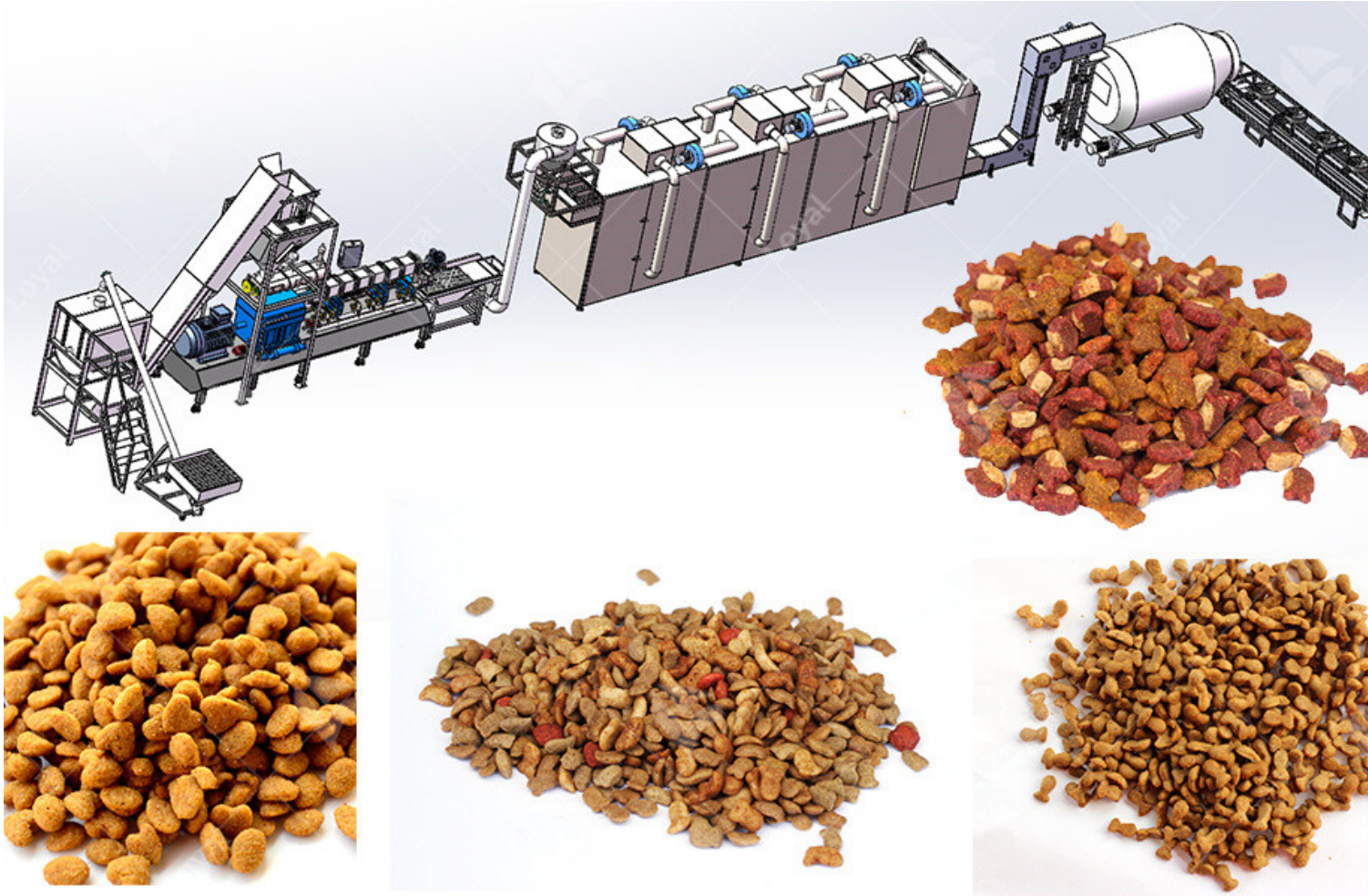
The Parameter Of Large Pet Feed Process Line