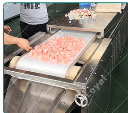
Sample Puffed Prawn Cracker Microwave Automatic Industrial Tunnel Continuous Microwave Machine