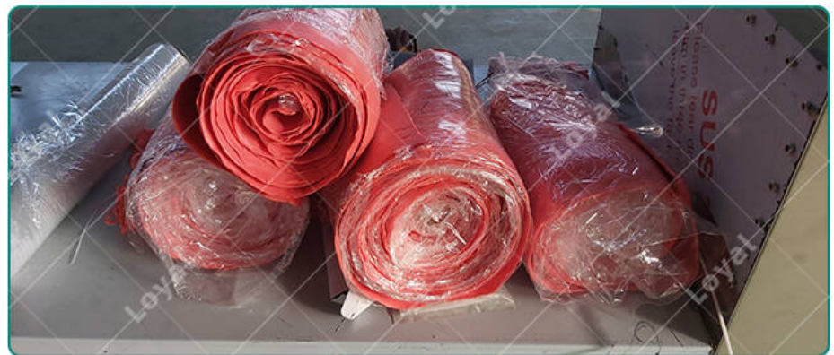
Testing of Continuous Microwave Rubber Mattress Drying Machine in factory