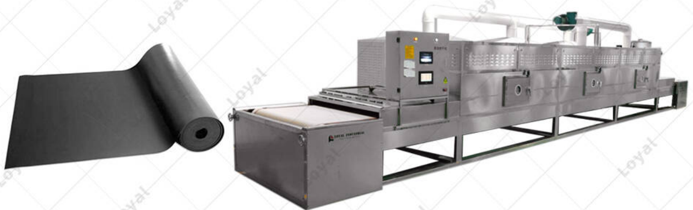
CAD of Continuous Microwave Rubber Mattress Drying Machine