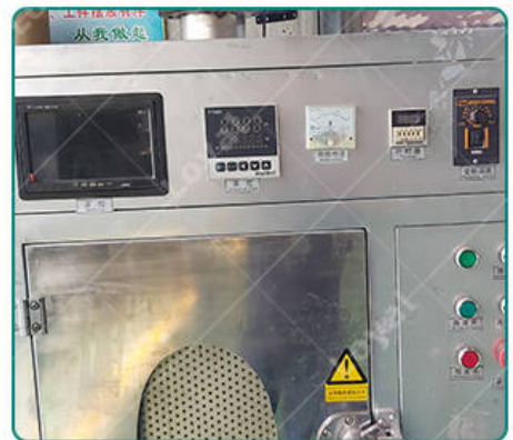
Continuous Microwave Rubber Mattress Drying Machine in factory