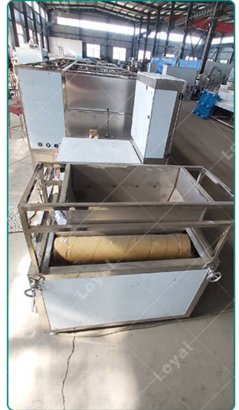
Detail of Industrial Microwave Date Drying Sterilizing Machine in Manufacturing Plant

Why Is PLC Industrial Microwave Date Drying Sterilizing Machine So Efficient?