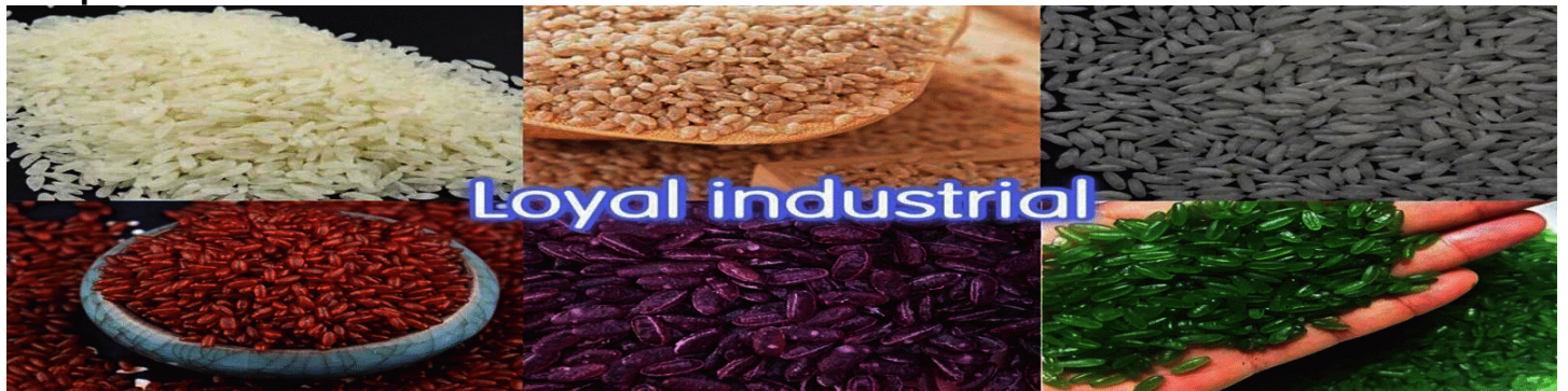
Sample Pictures of Industrial Instant Rice Making Machine Fortified Rice Processing Line