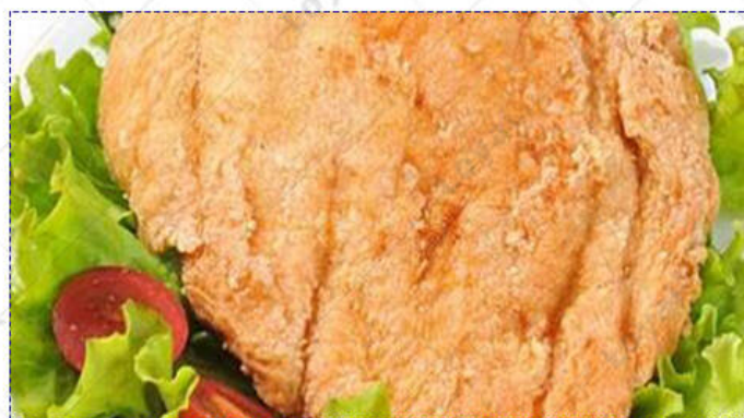
Samples Of Continuous Chicken Fillet Frying Equipment