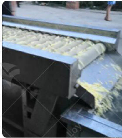
The Parameter Of Fully Automatic Potato Chips Process Line