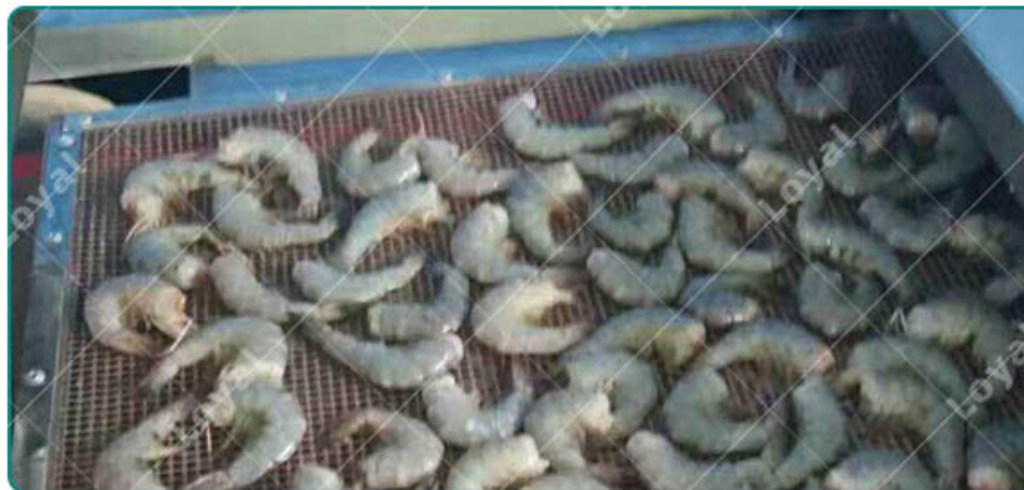
Applications Of Microwave Prawn Drying Machine: