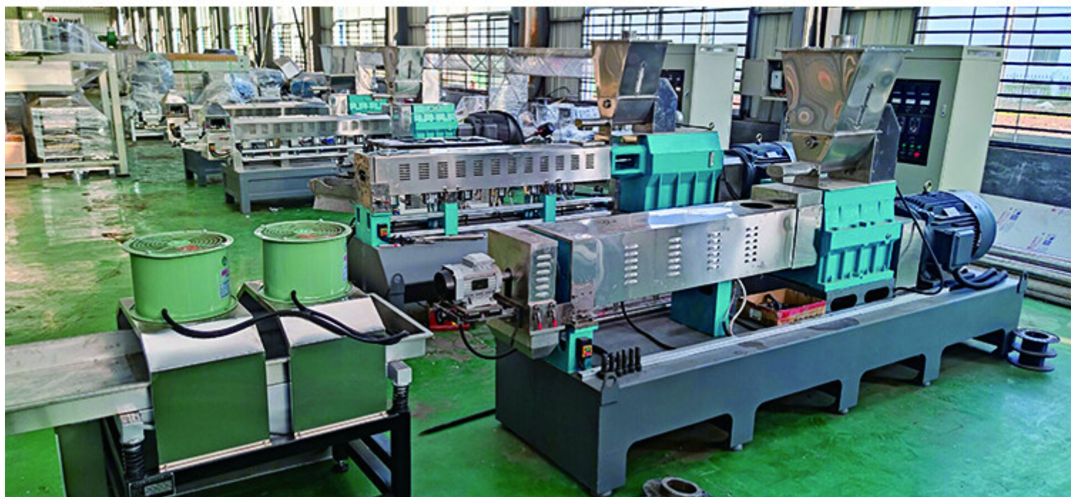
The Advantage Of Large Pet Feed Process Line