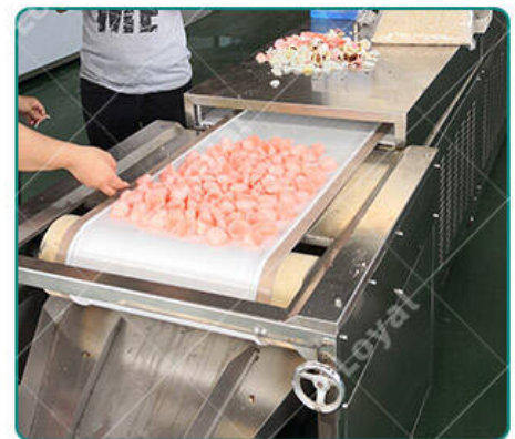
Sample Puffed Prawn Cracker Microwave Automatic Industrial Tunnel Continuous Microwave Machine