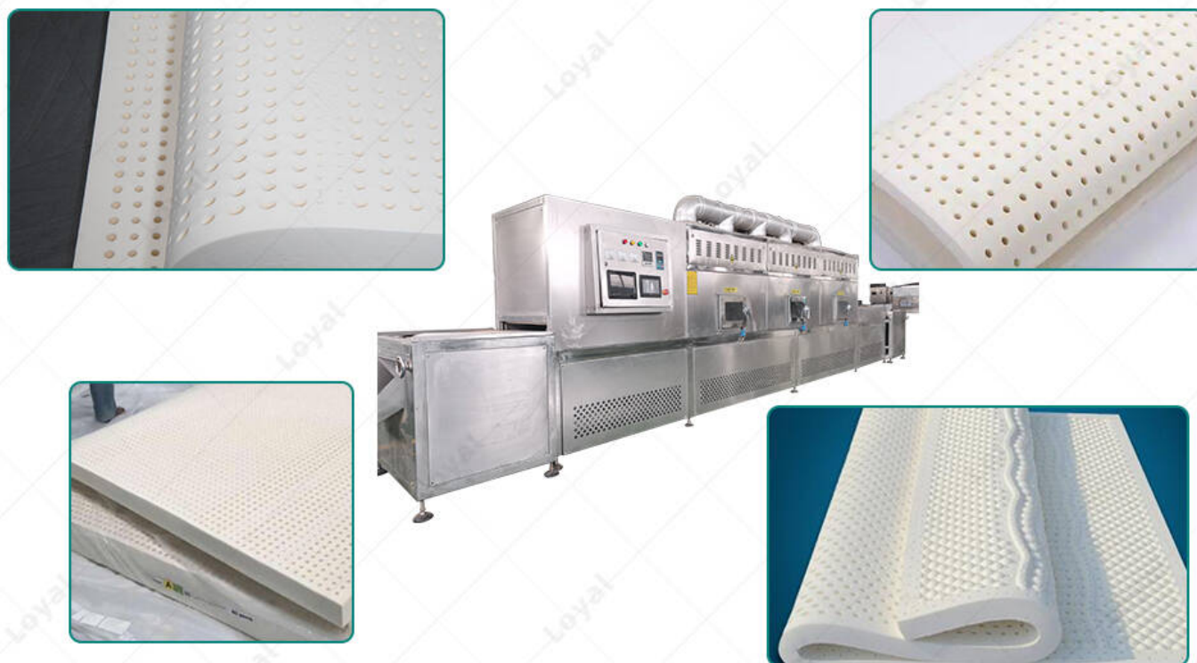
Sample of Continuous Microwave Rubber Mattress Drying Machine

The core of rubber microwave drying equipment is a microwave generator. At present, the frequency of latex microwave drying is mainly 2450 MHz. Continuous rubber microwave oven is mostly used in the drying of chemical, food, agricultural and sideline products, wood, building materials, paper products and other industries. It can also be used for food, agricultural and sideline products, etc. sterilization.