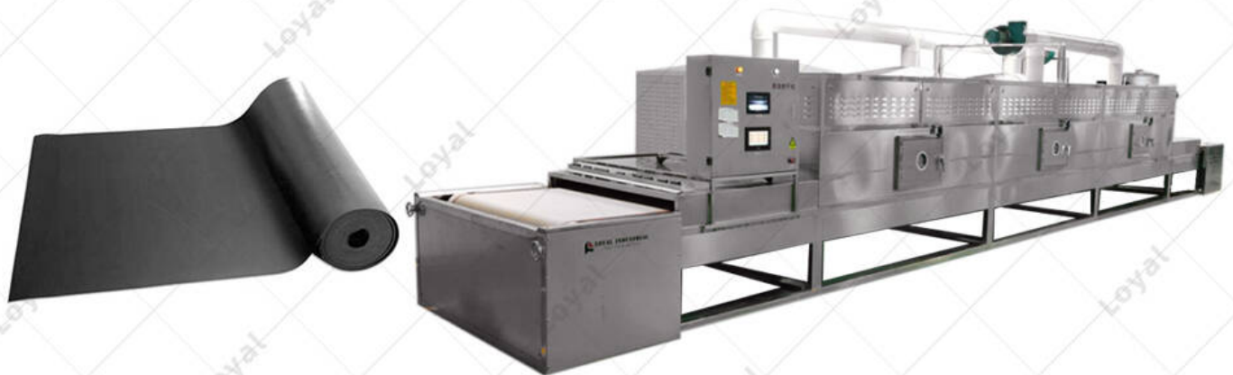
CAD of Continuous Microwave Rubber Mattress Drying Machine