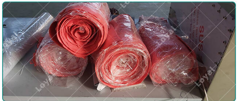
Testing of Continuous Microwave Rubber Mattress Drying Machine in factory