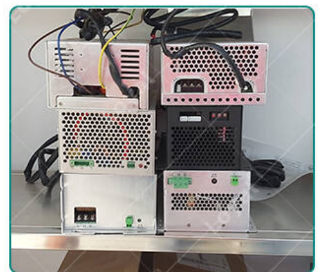
Detail of Layout of Microwave Insect Earthworm Tunnel Dehydrator Drying Machine in Workshop