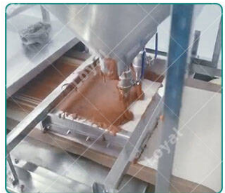
Microwave dryer condiment sterilization equipment production process workshop