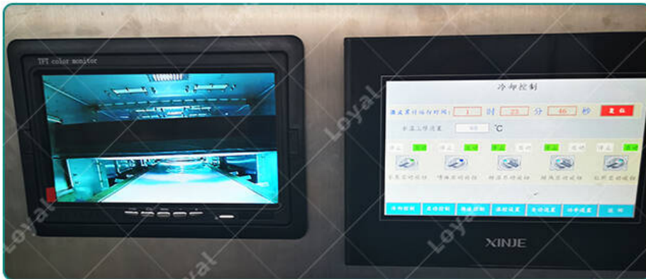
Detail of Industrial Microwave Date Drying Sterilizing Machine in Manufacturing Plant

Why Is PLC Industrial Microwave Date Drying Sterilizing Machine So Efficient?