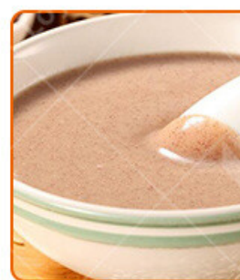
The Parameter Of Nutrition Powder Process Line