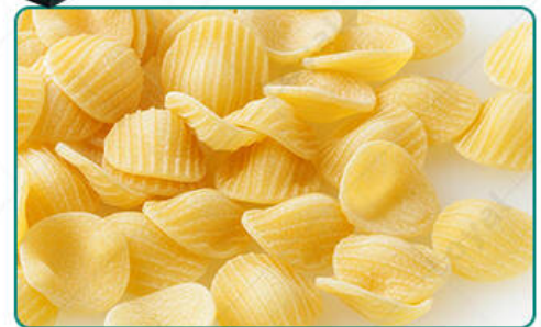
PLC control vacuum pasta processing line