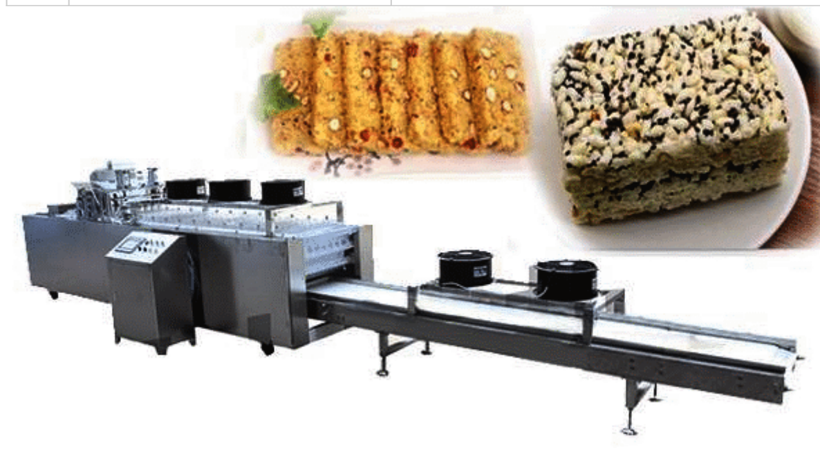
snack bar production line