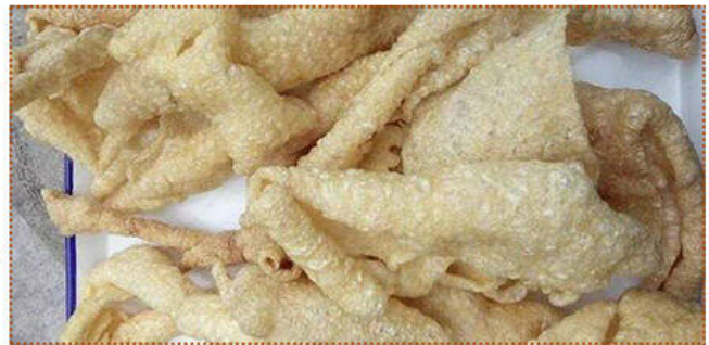
Application of Industrial Pork Rinds Frying Machine