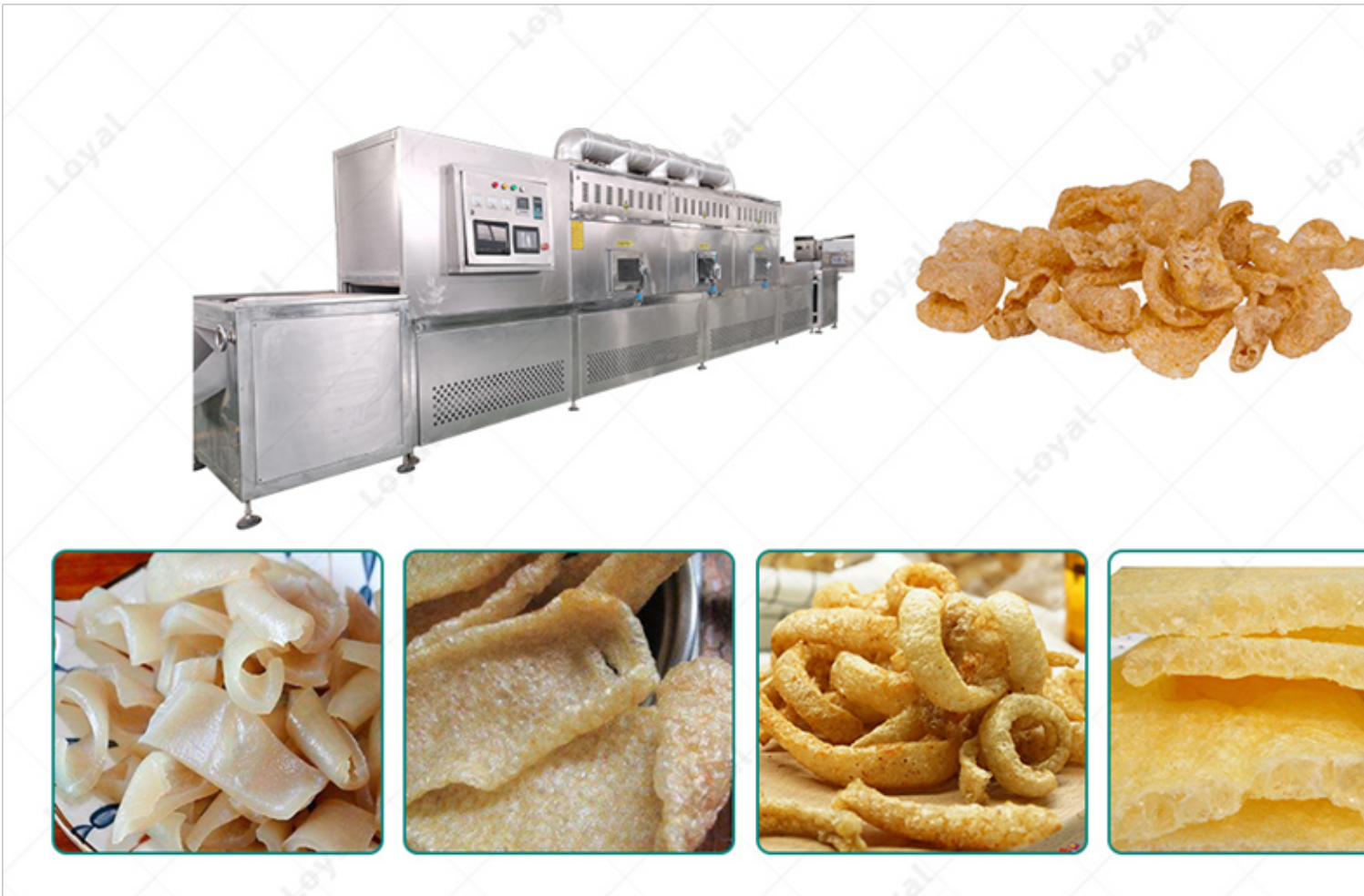
Parameter Of Microwave Pork Skin Puffing Machine: