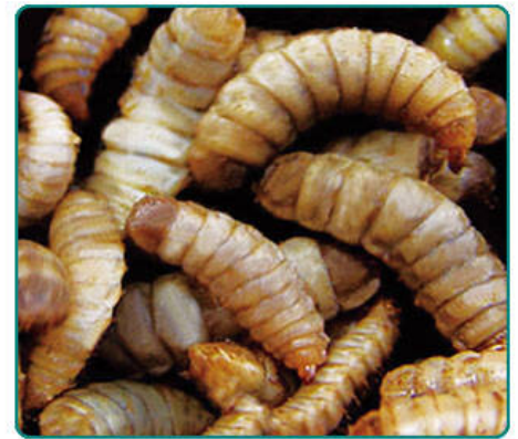
Black Soldier Fly Larvae of Industrial Conveyor Belt Type Microwave Oven Picture