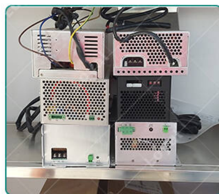
Detail of Layout of Microwave Insect Earthworm Tunnel Dehydrator Drying Machine in Workshop