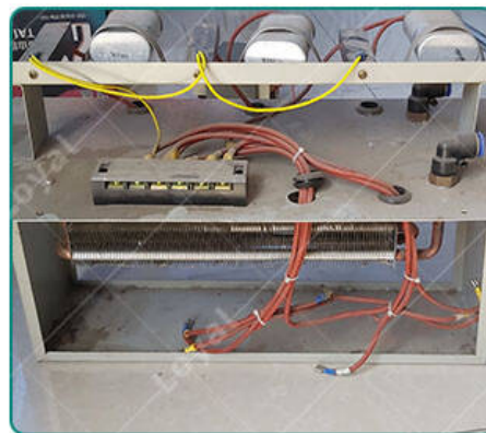
Cocoa Beans Microwave Drying Machine in customer's factory Customer Cases For Cocoa Beans Microwave Tunnel Drying Machine For Factory In 2021