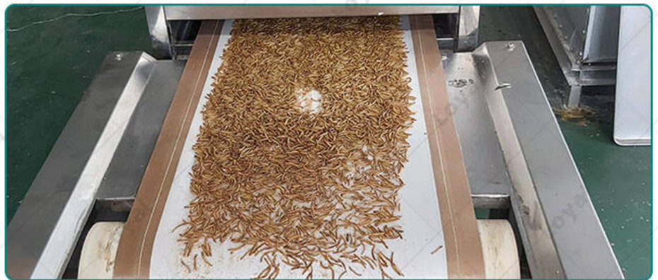
Test of Tenebrio Mealworm Insect Microwave Drying Sterilization Machine in Customer's Workshop Tenebrio Mealworm Insect Microwave Drying Sterilization Machine Video