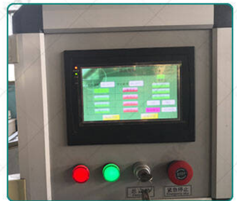
Detail of Tenebrio Mealworm Insect Microwave Drying Sterilization Machine