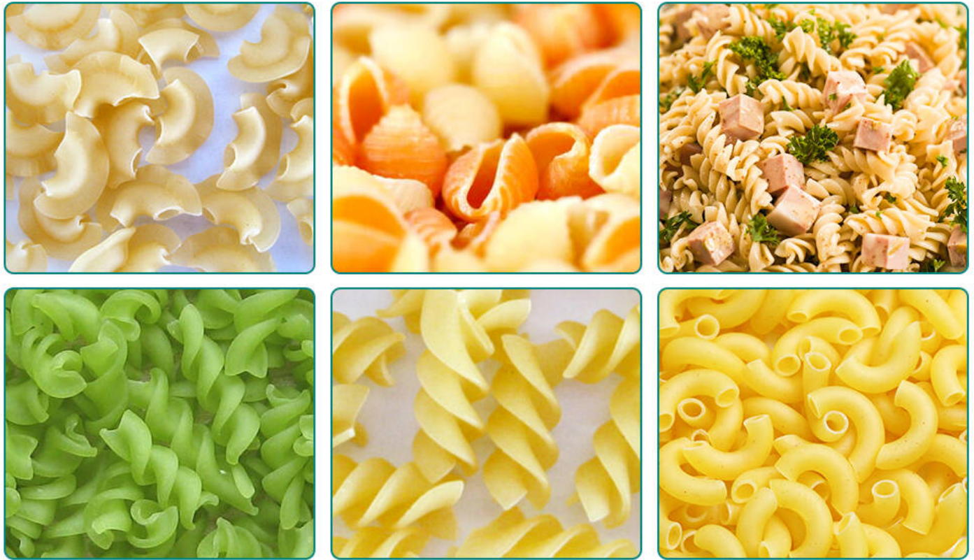
Samples Of PLC Control Vacuum pasta Processing Line