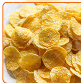
The Production Line Details