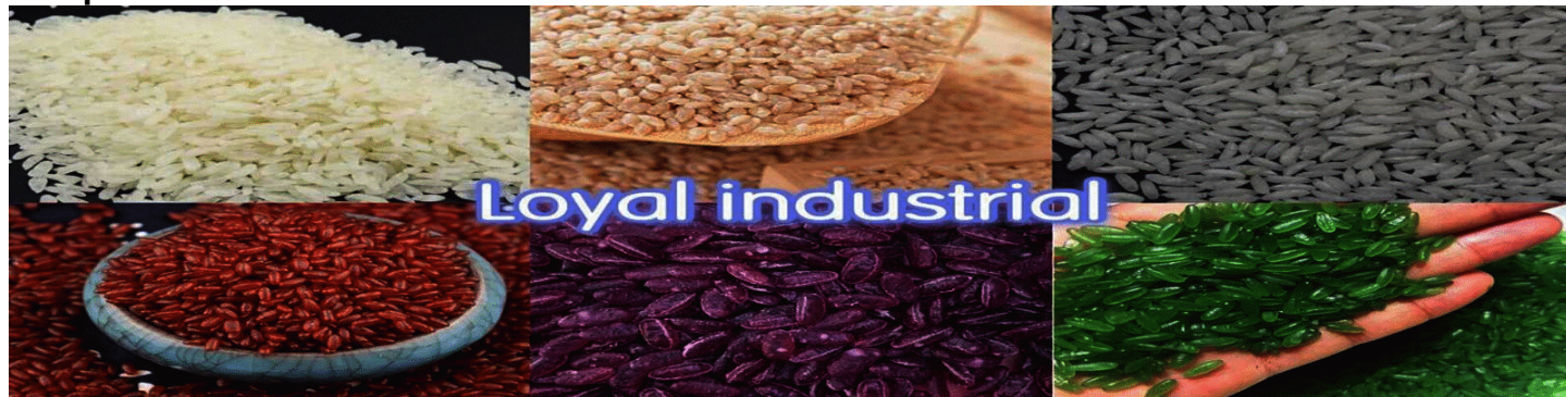
Sample Pictures of Industrial Instant Rice Making Machine Fortified Rice Processing Line