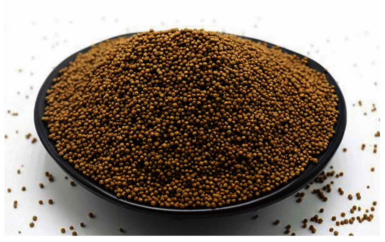
Where is fish meal products?

What is fish? Fish powder uses one or more fish as raw materials, high-protein feed materials made for dehydrated, and pulverized. So far the fish powder is still an important animal protein to add feed, estimated the feed of poultry, pigs, morties, breeding fish and pets.